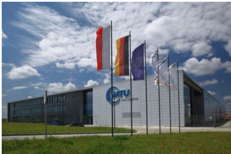
MTU AeroEngines Poland