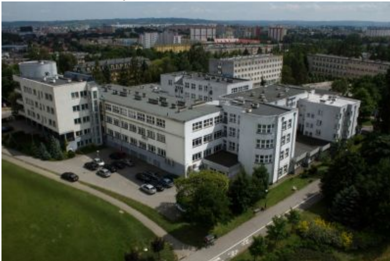
University of Information Technology and Management