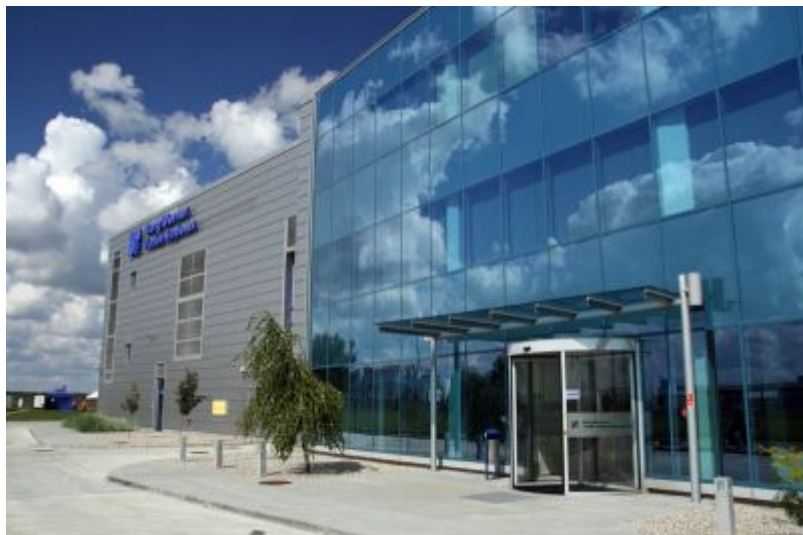
Borg Warner Poland