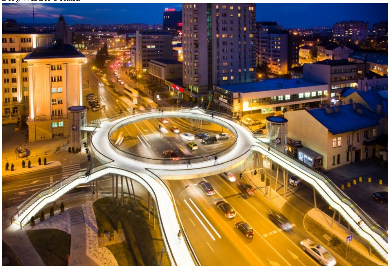
Kładka okrągła nad al. Piłsudskiego