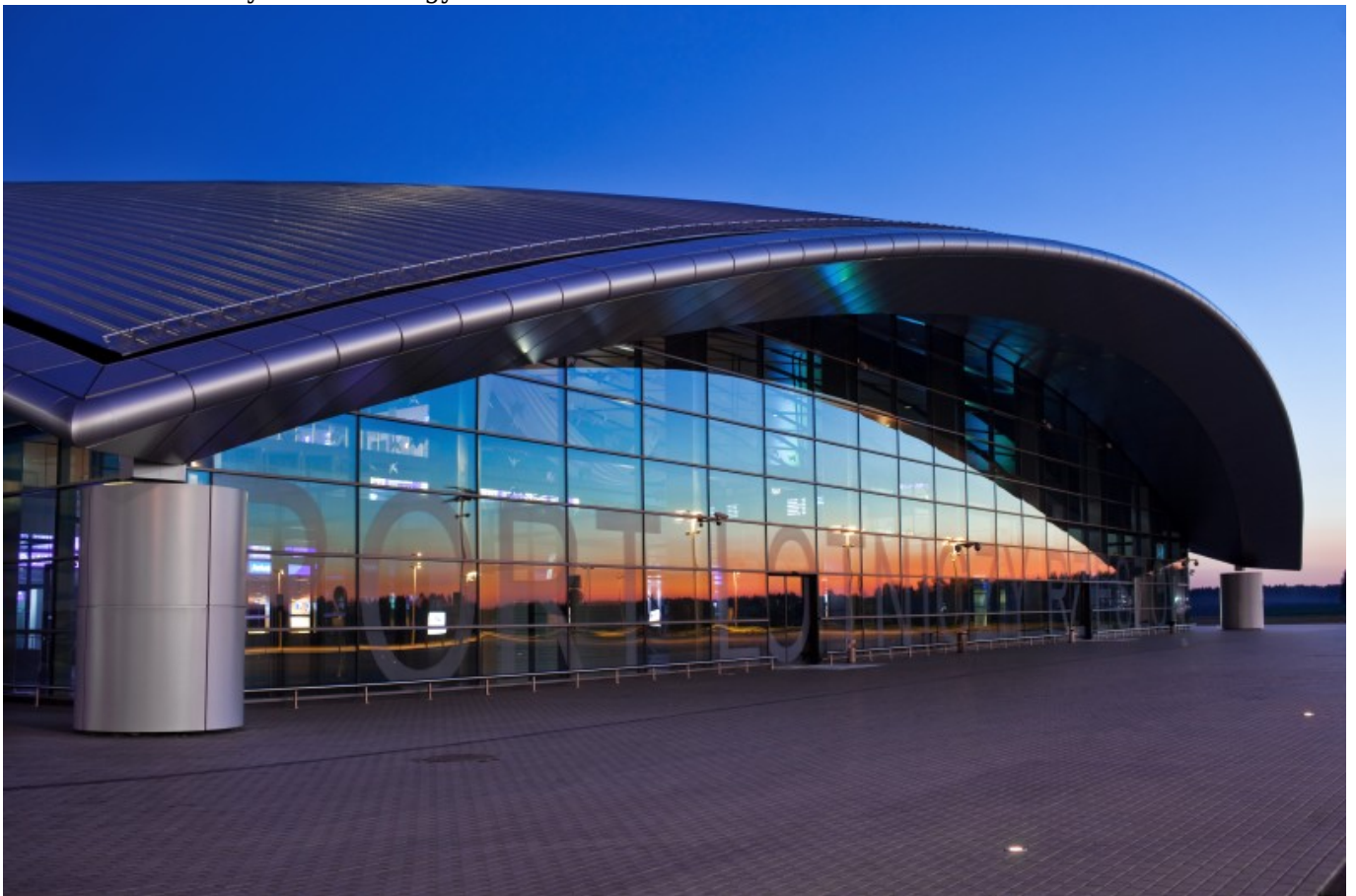
Rzeszów-Jasionka International Airport