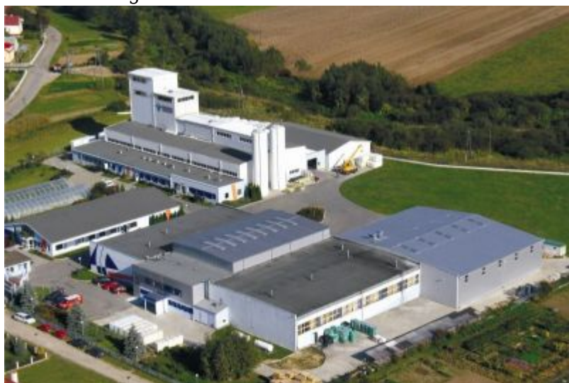
Marma Polish Films